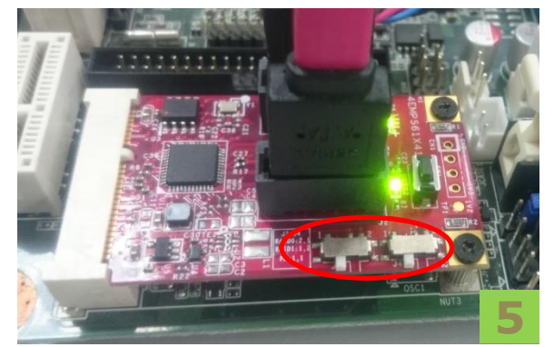
Please use slide switch J3/J4 to change RAID mode as above setting list.

Press 'Ctrl-r' to enter RAID menu during this scene.