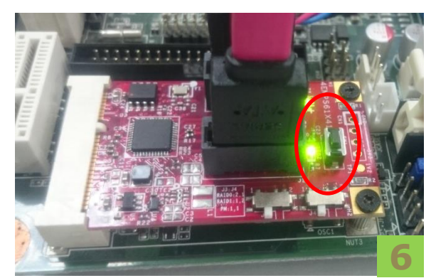
Please push tact switch 3 seconds for reset then check RAID menu in step 4 to see if it takes effect.

You can config and check RAID status in this RAID menu before installing OS.