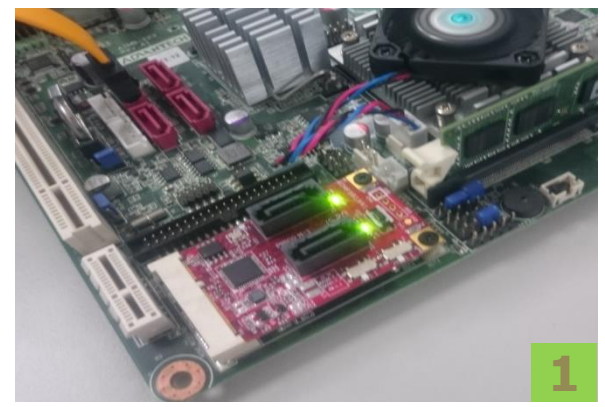
Please connect EMPS-32R1 to onboard mPCIe slot.