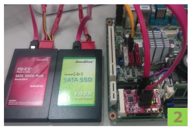
Please connect SSD in EMPS-32R1 SATA slot.